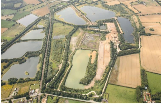
Aerial shot of Whisby Quarry

Whisby Quarry is a sand and gravel quarry located approximately 2km to the east of Eagle and is operated by Tarmac.