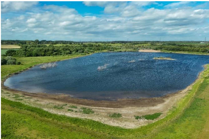
Restored Wetland at Whisby Quarry

Quarries are, by their nature, long-term neighbours. That is why supporting local projects is an important part of how we operate at Whisby Quarry, alongside our day-to-day work to manage environmental impacts and restore land that we have finished extracting.